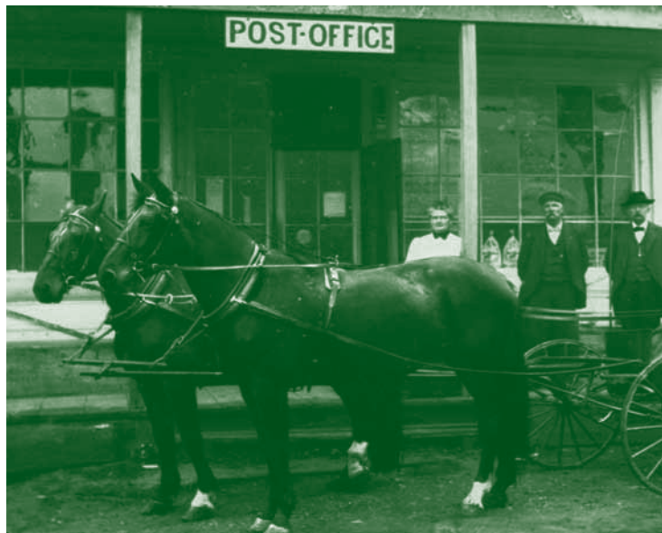
This image from the early 1900s shows the Ada Post Office when it was located at the corner of Ada Dr. and Thornapple River Dr. (the site of the current telephone building.) That building burned down in 1920. For years after that, the Post Office was located in the Masonic Temple building on the corner of Ada Dr. and Bronson St. (now the Ada Bike Shop and Schnitz Deli.) Students from Calvin College treated the photograph to a colorization process for inclusion in the new Ada history video, "Ada: Historical Momentum."