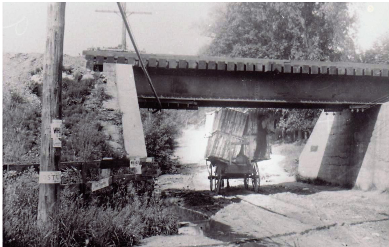
Caution – Low Clearance! This driver must have heaved a sigh of relief after barely clearing the railroad viaduct at Bronson Street. The horse-drawn wagon overloaded with crates will continue its climb up Ada Drive. Still a dirt road here about 1900, Ada Drive was then known as Main Street or Cascade Street.

11:00 am – 5:00 pm at the Averill Historical Museum and others. The Spring Into the Past small museums tour and open house will be May 5th and 6th. All museums in the Tri River group will be open that weekend and all will be FREE. The theme again this year is “Fashion Through the Ages.” Pick up the 2018 museum booklet showing all other locations at the Ada museum.