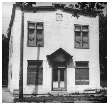
Look familiar? Think bikes and great deli... The Ada Masons #280 F&AM completed this structure on the corner of Ada Dr. and Bronson St. in April 1910. Note the original Masonic Square and Compass emblem at the top. Over the years, the Masonic Temple building has also served as a bank, the Ada Town Hall, Ada Post Office, Ada Library and Amway's first warehouse.

Please continue to support the vendors each Tuesday, from 11 a.m. until 4 p.m., until the end of October. Stock up on late autumn produce to tuck away for early winter meals. If you have extra tokens, remember this is the last year to use them!