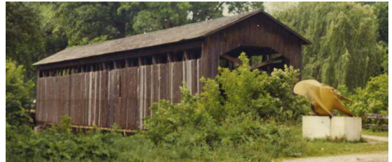
Right now, Ada's beloved covered bridge is decorated for the holiday season. Back in the 1970s, a "sculpture" adorned the bridge year-round. A five-ton propeller from a generator at Ada's dam was lifted from the bottom of the river, painted, and put on display. It became known as "Ada's Dam Thing" or "Ada's Calder" (referring to Grand Rapids' La Grande Vitesse by Alexander Calder also installed in 1969).

Be on the lookout for plaques as several are already in place in the village and greater township. Contact AHS for further information or check out our website www.AdaHistoricalSociety.org .