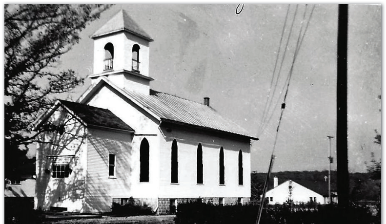
The Community church, in the heart of the village and home to the Ada Farmer's Market, descends from the Reformed Church of Ada who met in this building on the same site. By 1901, the church was being rented for 50 cents per Sunday service to the newly-forming Reformed Church by previous occupants, the Methodist Episcopal Church who built it in 1871. The old church was torn down in 1968 to make way for the new.

Do you have computer tech skills and a few hours once a month to volunteer? We are looking for help with the museum office computer – updating, backing-up, and other basic support. AHS is a small, volunteer-run, non-profit organization and a small amount of your time could make a big impact. Please email AdaHistoricalSociety@gmail.com if you can help. Thank you!