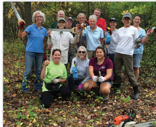
Volunteers – Carl Creek Stewardship

Volunteer opportunities are available to assist with grounds, gardens, trails, habitat stewardship, office work, special projects and youth education programs. Residents may also participate on committees and the Parks, Recreation and Land Preservation Advisory Board which assist with planning and development. Contact the Park office for an application, interview or schedule of events.