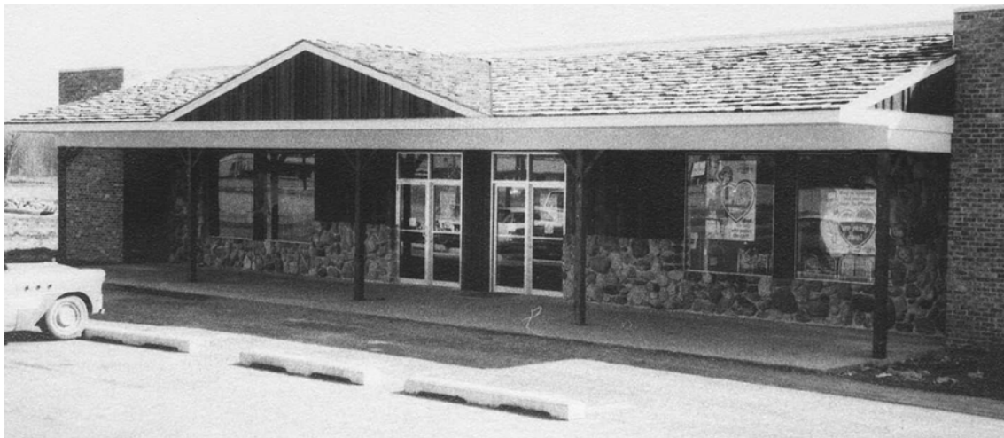
The IGA grocery store in 1966 that later became Adgates. In 1971, Shopper's Square, Ada's original strip mall, was purchased and renamed Thornapple Village of Ada. It included the IGA, Debonair Dress Shop, a beauty salon, and barber shop. Soon Thornapple Village Inn, Thornapple Orvis Shop and the Little Red Schoolhouse ice cream shop were added. These structures were located where construction is ongoing for the new hotel and businesses along the Thornapple River.

The Centennial Properties program continues to recognize homes and commercial buildings 100 years of age and older. We honor the importance of historic properties and the value they add to our community today. Check our website www.AdaHistoryCenter.org for more information on the program and an application.