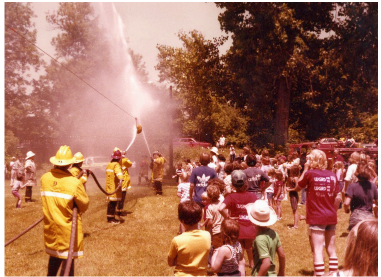
A battle to the drench! Water battles like this one c.1980 at Leonard Field often pitted Ada and Cascade Fire Departments and were highlights of the annual 4th of July celebrations.

The Centennial Properties program continues to recognize homes and commercial buildings 100 years of age and older. We honor the importance of historic properties and the value they add to our community today. Find photos of all these treasures on our Facebook page. Check our website www.AdaHistoryCenter.org for more information on the program and an application. Contact us with any questions.