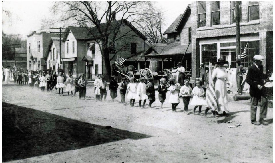
I love a parade! Ada children march down Ada Drive in honor of Memorial Day (Decoration Day) about 1915.